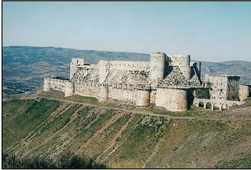
Fortress of the Knights Hospitallers [Catholic military/religious order], Syria, mid-12c